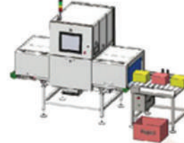
Push board removal.