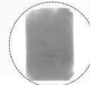
Yeast powder (marked image)